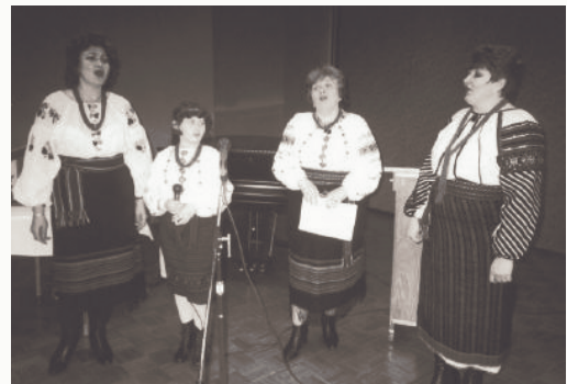
Holubka Trio of Philadelphia