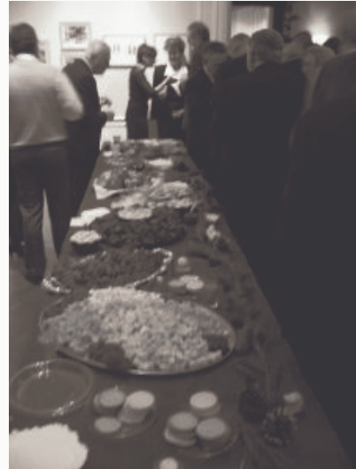
Guests enjoying food & drink

been preparing his excellent and varied menu of hors d'oeuvres for the New York City for many long years and the New York City Chapter greatly appreciates his hard work.