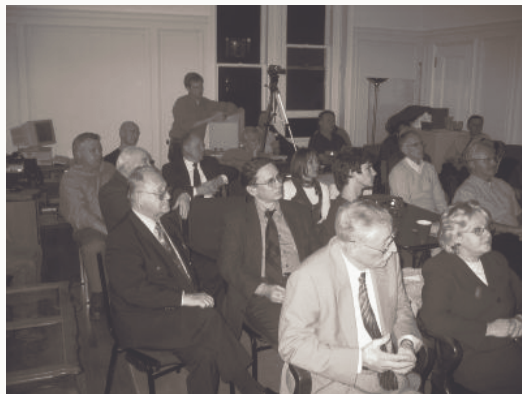
Lecture attendees filled the UESA meeting to standing room only