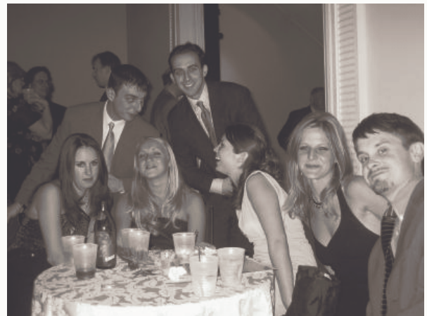
NYC Zabava guests enjoying the evening

Guests were able to enjoy light hors d'oeuvres and drinks while dancing to the early hours of the morning.