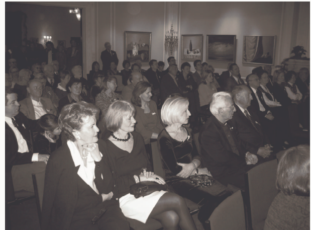
Yalynka guests enjoying the musical program

As in past years, the New York City Chapter of the UESA together with the Ukrainian Medical Association (UMANA) and the Ukrainian Institute of America (UIA), held the annual New York City “Yalynka” (Christmas celebration) on the evening of December 13, 2003. The event, as always, was held at the Ukrainian Institute of America (UIA) in New York City.