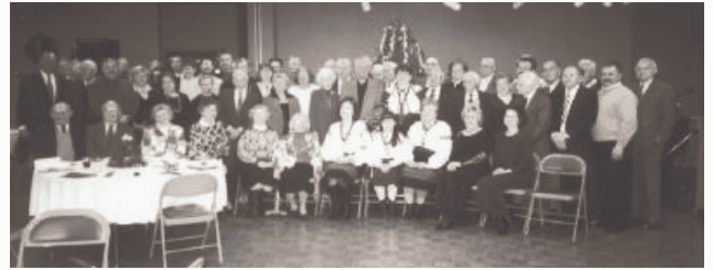
Attendees of the Philadelphia Yalynka

The annual UESA Philadelphia Chapter "Yalynka" (Christmas celebration) was held on Sunday, January 11, 2004 at the Ukrainian Educational and Cultural Center in Jenkintown, Pennsylvania.